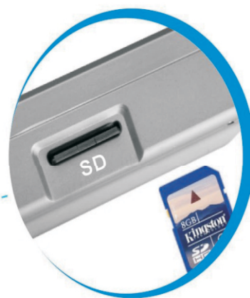
Video System+Light Source+Monitor