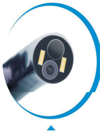
Outer diameter 3.0mm with 1.2mm instrument channel