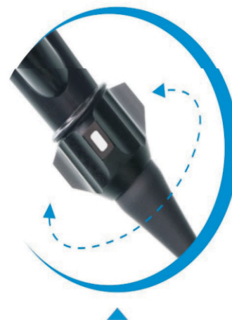
Rotation Function, Left:120° Right:120°